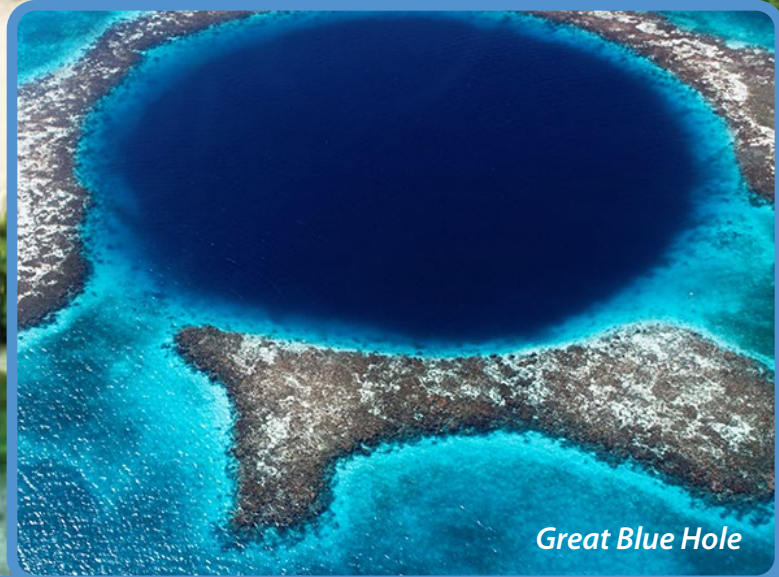
Great Blue Hole

4 DAYS & 3 NIGHTS OF ISLANDS SNORKELING, RAINFORESTS, MAYAN RUINS